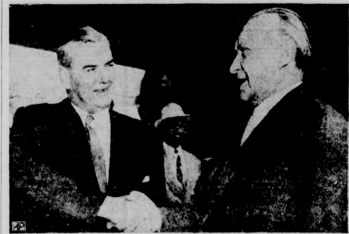
LABOR FOLLOWING DISPLAYS LOYALTY TO PRESIDENT CLERGY